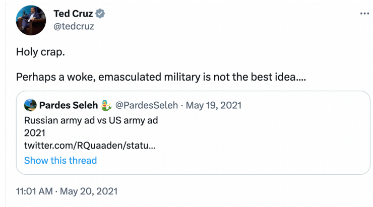
Tweet from Senator Ted Cruz, May 20, 2021.