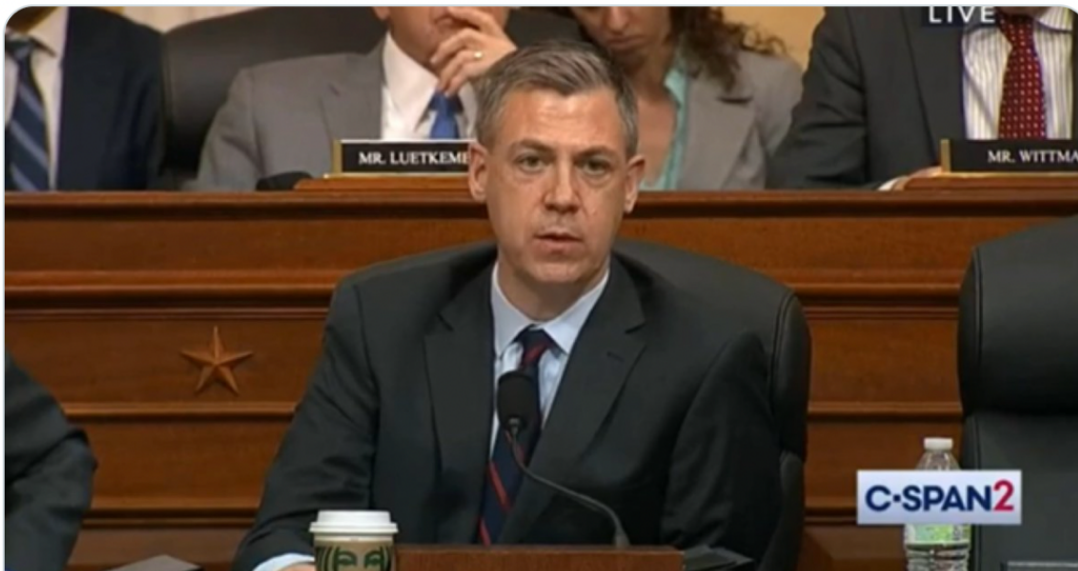
Representative Jim Banks spreading disinformation about DEI in the military, July 11, 2023.