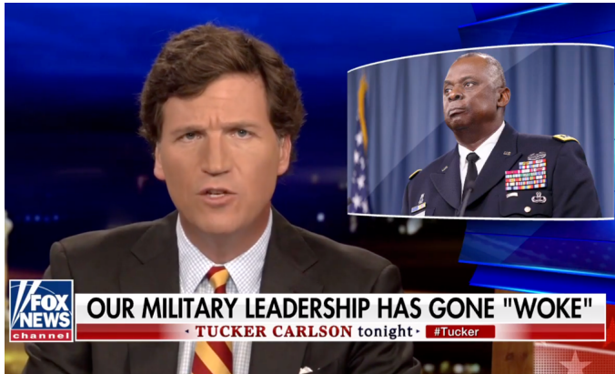
Tucker Carlson on FOX News, March 26, 2021.