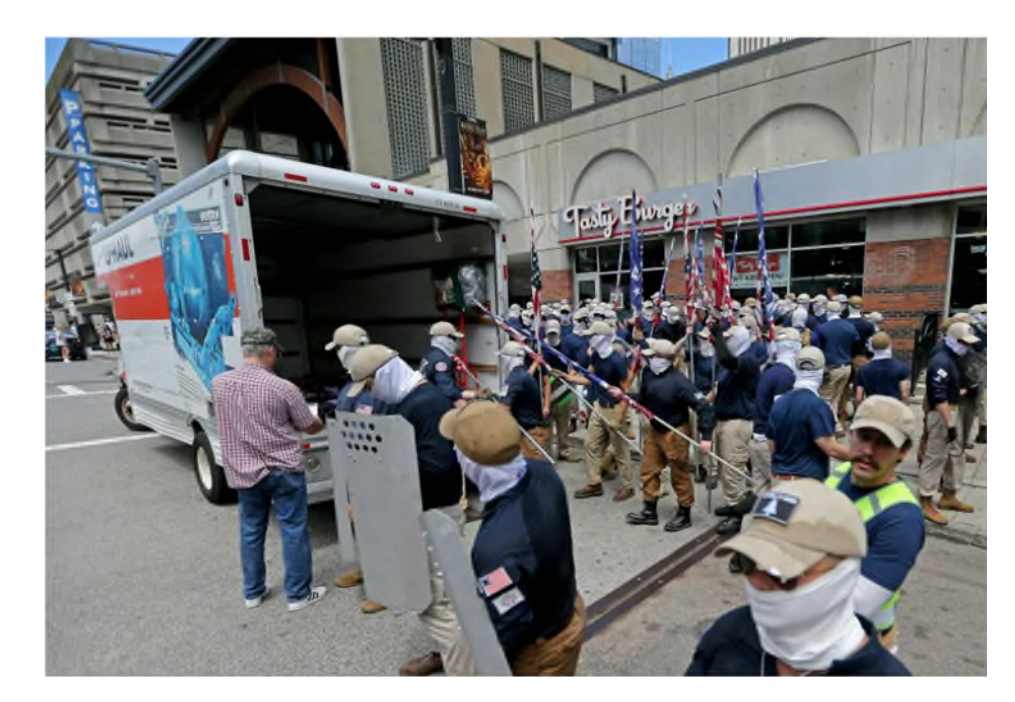
Patriot Front Members Loading Flags and Shield into Rental Truck<sup>5</sup>

115. After law enforcement broke up the attack at around 1:30 p.m., the Patriot Front members loaded their materials back into the rental truck, which other members had moved near Back Bay Station, and decamped via the T.