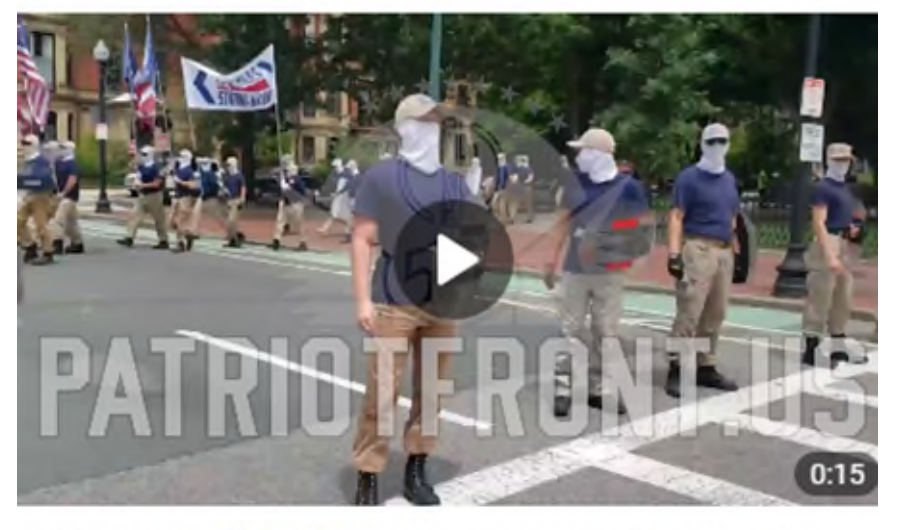
LIVE UPDATE: #PatriotFront activists are currently marching in Boston, MA in recognition of Independence Day. 11.8K @ 16:55