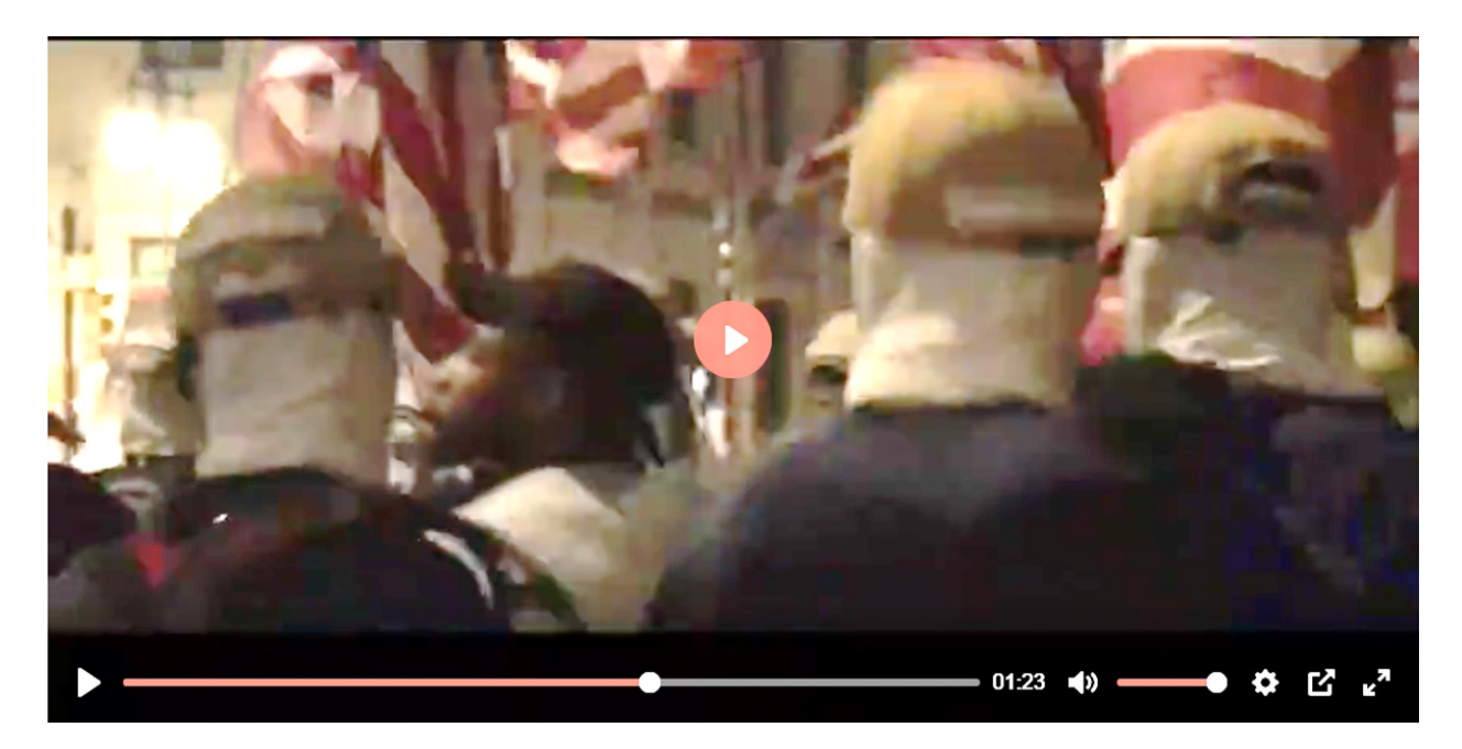
67. In another frame, the video shows a black man with what appears to be blood on his shirt while Patriot Front members—again wearing their signature uniform—march past.