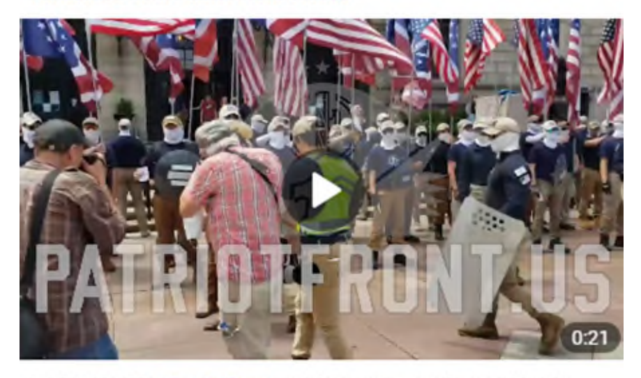
LIVE UPDATE: #PatriotFront activists are currently marching in Boston, MA in recognition of Independence Day. 12.5K • 16:55

103. According to eye witnesses and news reports, the group's demonstrations began when, sometime before 12:30 p.m. on July 2, 2022, a large group of Patriot Front members approached a rental truck parked near the Haymarket T stop and unloaded shields bearing the Patriot Front emblem and a number of different flags. Those flags included: flags bearing the Patriot Front emblem, U.S. flags, some of which were flown upside down, flags with 13 stars representing the original U.S. colonies, and flags displaying symbols associated with Benito Mussolini's National Facist Party.