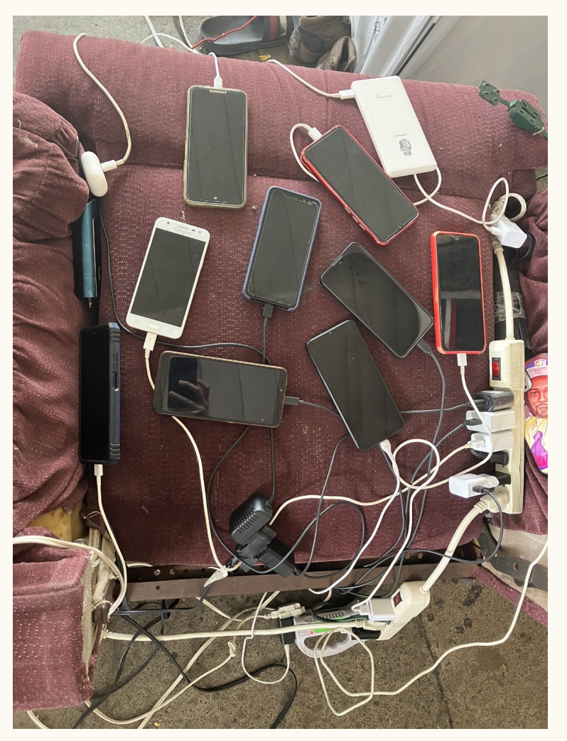
Phones charging inside the Haitian camp in Matamoros, Mexico.

In addition, the asylum ban disparately harms many Black asylum seekers by imposing penalties on those who do not have CBP One appointments when the app is not even available in the languages spoken by many African and other Black asylum seekers and continues in some cases, despite improvements, to fail to recognize darker skin tones.