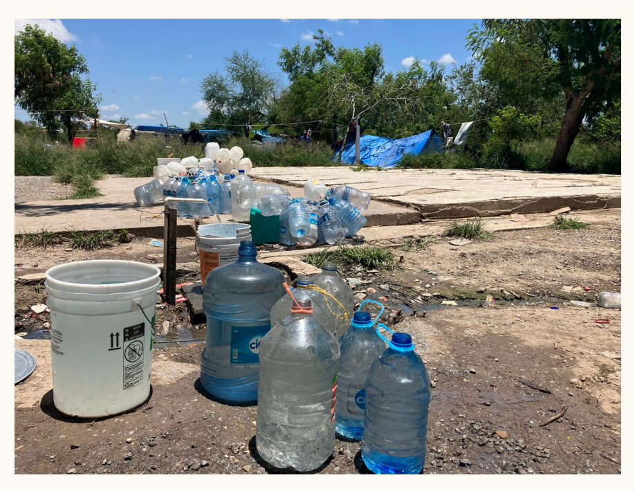
Matamoros encampment, June 2023.