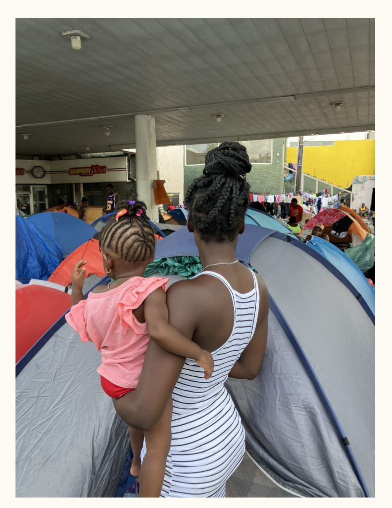
Haitian mother and child wait for a CBP One appointment