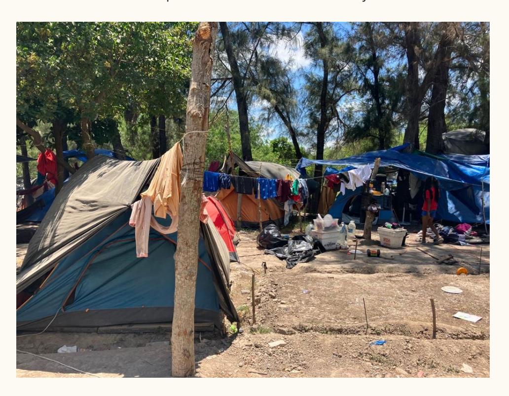
Makeshift tents in the Matamoros encampment, June 2023.

Many people waiting in Mexico to seek asylum are living in makeshift encampments with none of the necessary safeguards or systems in place to protect women, children, LGBTQ+, and other vulnerable people from being targets of abuse and violence. Local aid workers report instances of the cartel terrorizing the Matamoros camp in June 2023 as well as individuals and families facing heightened risk of kidnapping, rape, and other violent harm in the encampments and outside shelters in Reynosa.