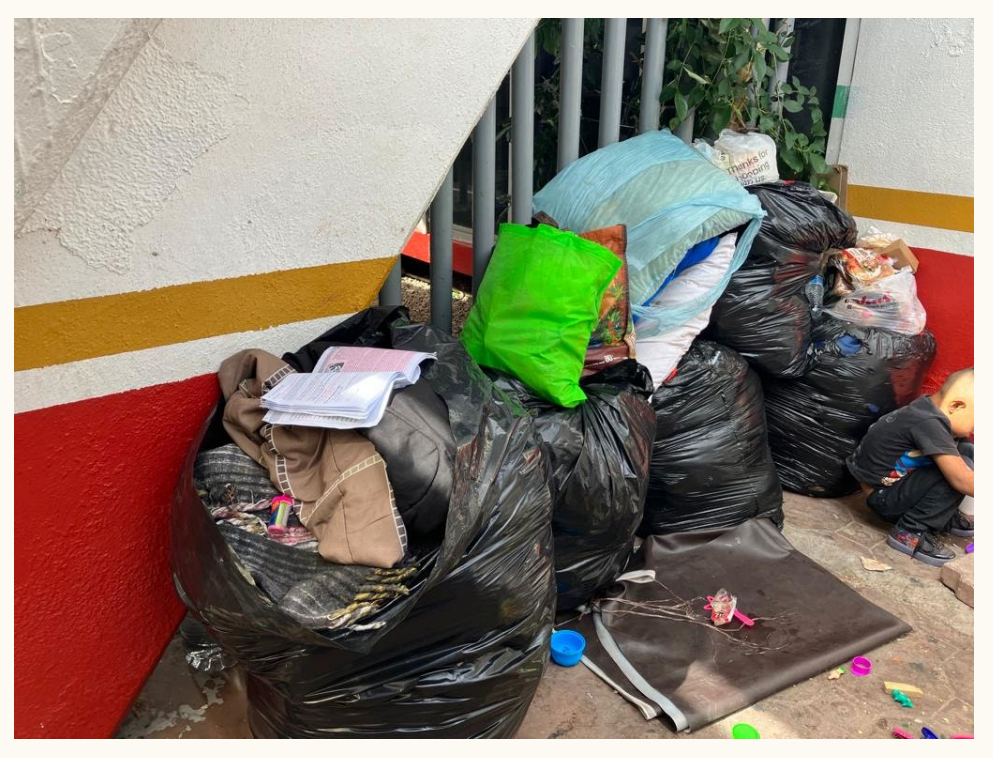
Outside the Nogales DeConcini Port of Entry, a child plays near blankets that asylum seekers used to sleep.

A <u>June 2023</u> report by the Florence Project, Human Rights First, and Kino Border Initiative documented how the Mexican municipal authority in Nogales was issuing QR codes in administering a waitlist of individuals waiting to seek U.S. asylum without an appointment. Since then, the municipal agency has stopped issuing QR codes but it still administering the waitlist. That list has now grown to more than 400 people but CBP officers have only been processing approximately two families from this list per day, as reported by monitors from the Kino Border Initiative, resulting in a wait of one to two months . In Ciudad Juárez people seeking asylum at various ports of entry self-organized informal waitlists. In June 2023, families reported to Human Rights First that they had spent 15 nights waiting outside the Paso del Norte port of entry, with only a handful of families crossing one night in that time period. At the same time, at the Bridge of the Americas port of entry, several families and individuals were being processed by CBP officers daily, with some coordination taking place between CBP officers and those administering the waitlist as to the number of people to be processed, people waiting to seek asylum reported.