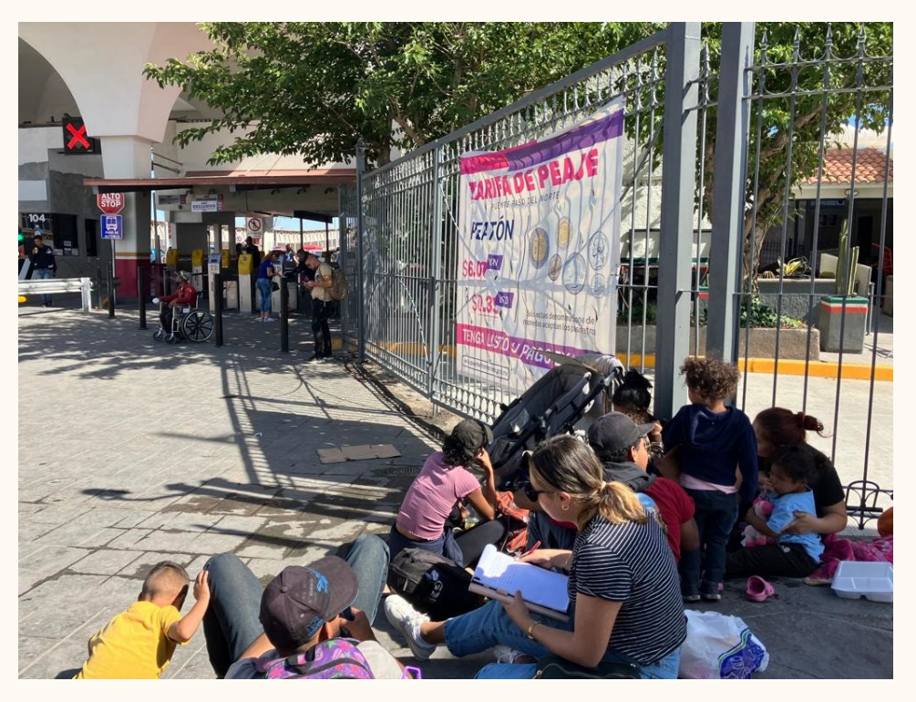
Outside the Paso del Norte Port of Entry in Juarez, families blocked from accessing asylum by Mexican authorities speak with a Human Rights First researcher.

In Tijuana, Mexican authorities administered waitlists such as one started by the National Migration Institute's Grupos Beta in June 2023 when an encampment outside the San Ysidro Pedestrian East port of entry was cleared by Grupos Beta, as reported by monitors from Refugee Health Alliance in Tijuana. CBP officers at the San Ysidro Pedestrian East port of entry were observed turning away a Mexican family attempting to seek asylum.