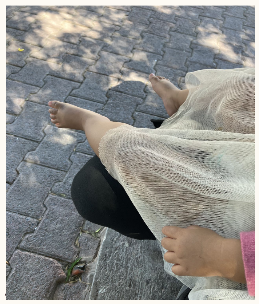
One-year-old child living on the street with her sister, mother, and aunt who were turned away by CBP at Matamoros Port of Entry.

A Honduran woman waited for months attempting to get a CBP One appointment and, after suffering rape and threats, was unaware of asylum ban and its penalties when she approached a port of entry and was turned away, but explained she would try again as she could not risk her life waiting longer. Fleeing persecution in Honduras, the woman, whose account is detailed above, spent three months trying to obtain a CBP One appointment while living alone in a makeshift tent in the Matamoros encampment where she was violently raped and threatened with death in late May 2023. Her rapist attempted to rape her again and she received death threats by phone. Terrified, she fled the camp and attempted to seek asylum at the port of entry but was denied access by Mexican officers. In June 2023, she explained to Human Rights First researchers that she was unaware of the bar to asylum protection and risk of being deported to Honduras if entering without a CBP One appointment but could not risk her life staying in Matamoros.