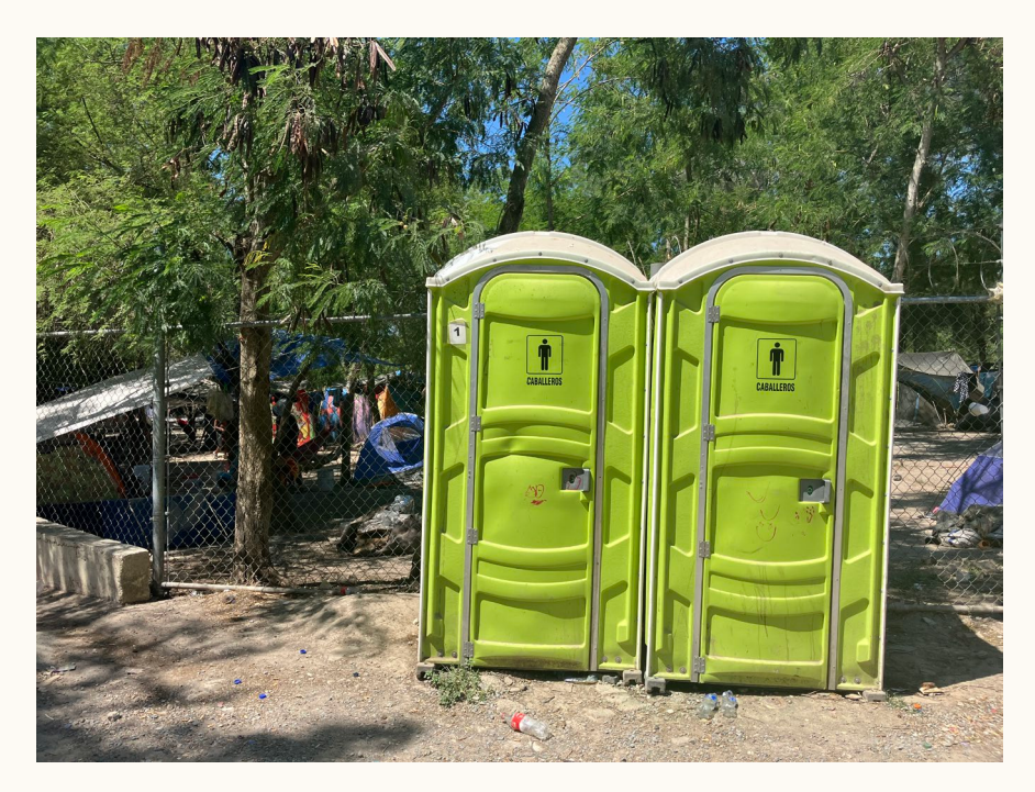
Matamoros encampment, June 2023.