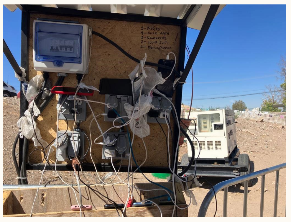
Asylum seekers charge their phones outside a temporary tent shelter in Juarez that has since been closed down.

In Matamoros and Reynosa, thousands of people waiting to seek asylum live in informal encampments, unable to afford a room to rent, medical care or food and water, let alone internet and electricity and yet must come up with about $200 Mexican pesos (nearly $12 USD) a week, on average, for internet data alone for months on end just to obtain a CBP One appointment to present at the port of entry to seek asylum.