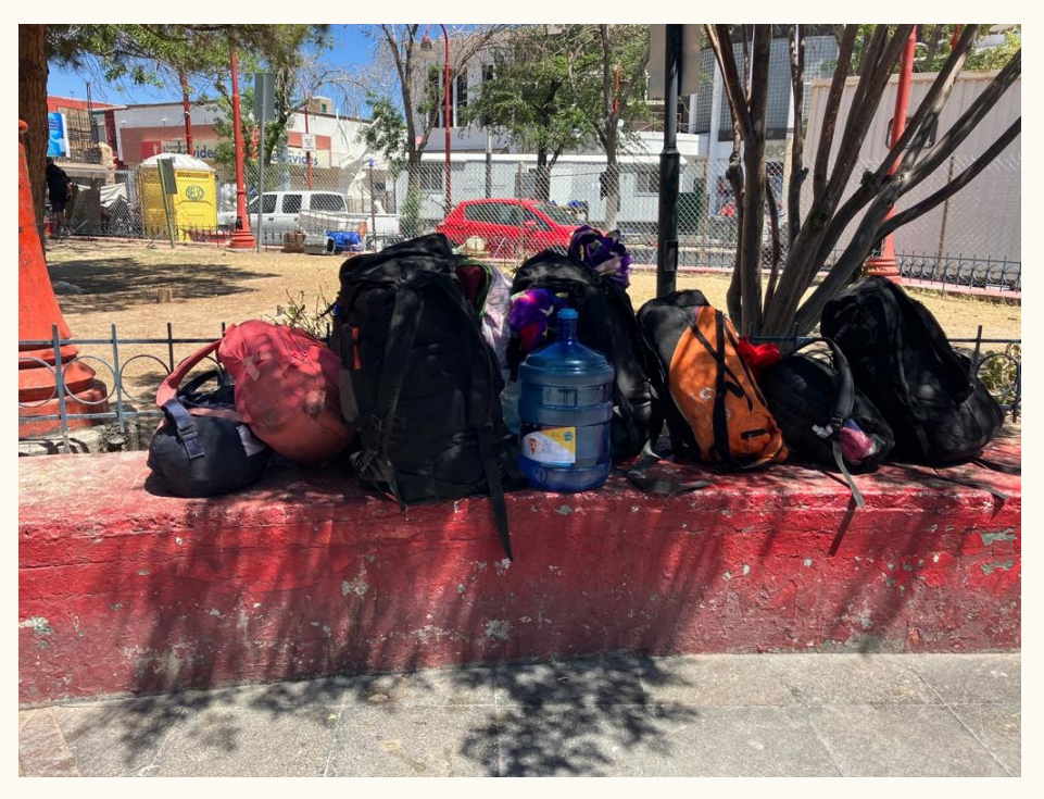
Belongings of families waiting to seek U.S. asylum in Juarez, Mexico, June 2023.

immigration officers'] cars. We're threatened that if we don't pay them, they'll deport us . We're charged anywhere from 50 to 500 pesos. Because of this, we've had to walk a lot to avoid the bus."