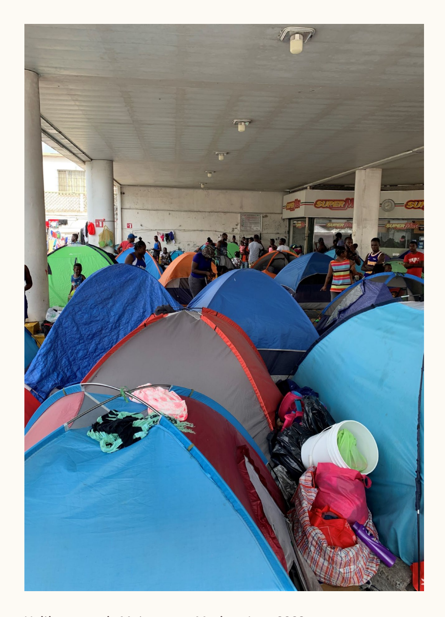
Haitian camp in Matamoros, Mexico, June 2023.

Non-Mexicans presenting at ports of entry without a CBP One appointment who are subject to the asylum ban can later try to overcome the ban and be considered for asylum if they can prove that they (or a member of their family who they are traveling with) faced an "exceptionally compelling" circumstance, such as at the time of entry into the United States, faced an acute medical emergency; an imminent and extreme threat to life or safety, such as an imminent threat of rape, kidnapping, torture, or murder; or was a "victim of a severe form of trafficking in persons," as defined by U.S. regulations.