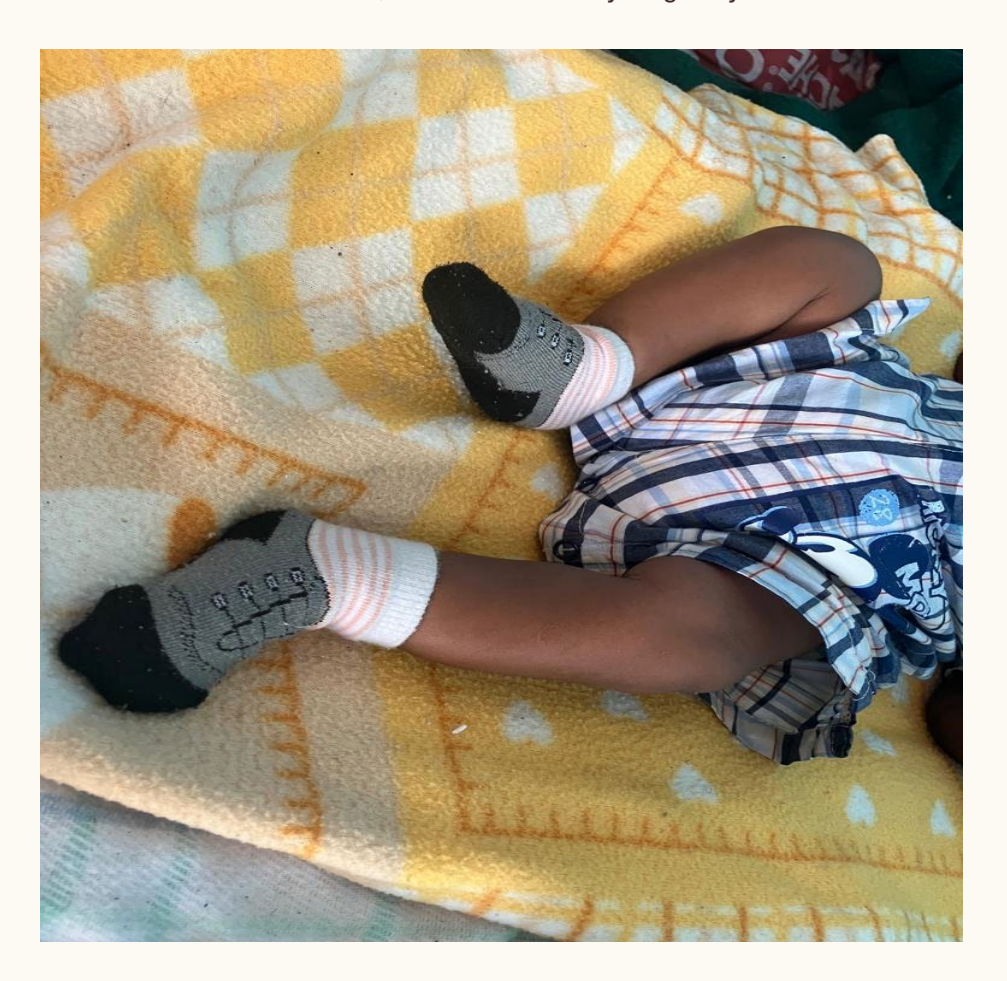
A sick Haitian one-month-old baby living in Haitian camp in Matamoros, June 2023.

A one-month-old newborn baby who was running a fever and had trouble breathing was sleeping in a tent in the extreme summer heat of a Haitian encampment in Matamoros. His mother received fever-reducing medicine from a Doctors Without Borders mobile clinic visit, but worried as her young baby was still at risk.