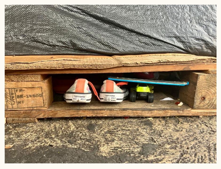
A child's shoes and toys are stored

Humanitarian workers in Mexico informed Human Rights First that the dire life-threatening situations facing asylum seekers and their needs for immediate safety drive their decisions, rather than the existence of the asylum ban rule.