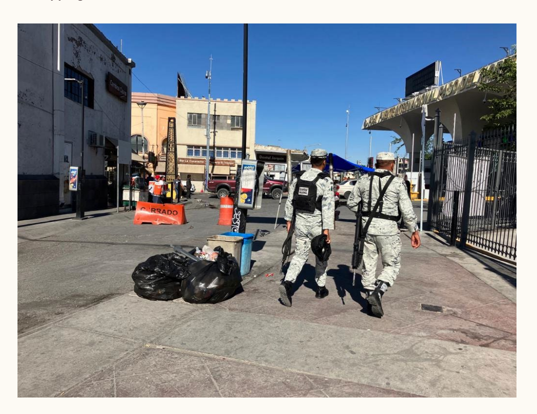
Members of the Mexican National Guard patrol the Paso del Norte Port of Entry in Juarez, Mexico, June 2023.

Abuses ranged from discriminatory and arbitrary detention, intimidation, robbery, extortion, sexual assault, and enforced disappearance through collusion with organized criminal groups by turning migrants and people seeking asylum over to them for kidnapping and ransom.