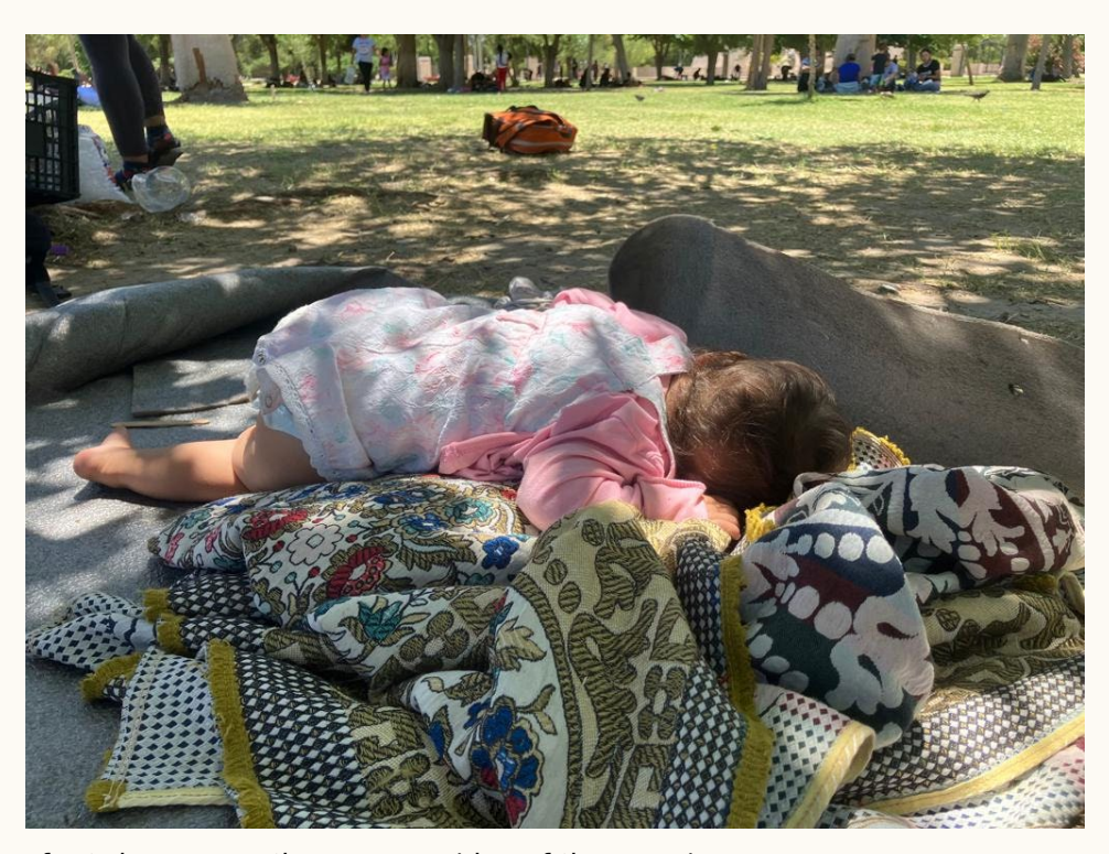
Infant sleeps near the Juarez Bridge of the Americas Port of Entry where her family has been waiting for five days.

• A Haitian man traveling alone and living in a camp in Matamoros explained that he was required to spend 100 Mexican pesos for internet data that lasts him four to five days in order to access the CBP One app to request an appointment to seek asylum, and because of this at times he did not have money for potable water while living in a tent outside in conditions of extreme heat. "It's not easy when you have 100 pesos. Our situation is very hard for us. When we don't have money to buy a bottle of water, I'm obliged to drink water that we use to take a bath."