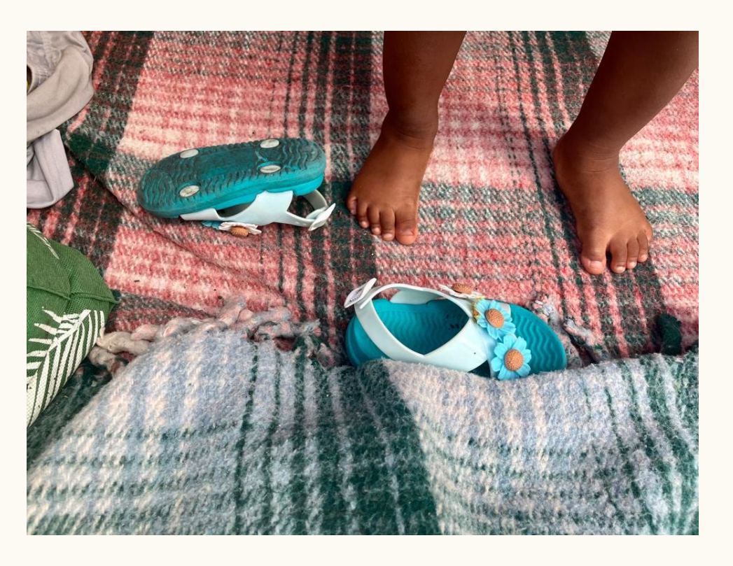
Young Haitian child living in a tent in a camp in Matamoros, Mexico, June 2023.

• Lack of safety, fears that daughters will be kidnapped, and inability to secure CBP One appointment after two months leave family wondering how to cross to safety. An Ecuadorean family with two teenage children and a six-year-old daughter fleeing threats of harm in Ecuador have been living in the Matamoros camp for two months, unable to obtain a CBP One appointment to seek asylum.