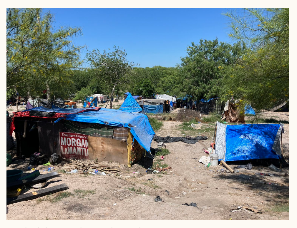
A makeshift camp where asylum seekers wait in Matamoros, Mexico near the border with Brownsville, Texas.

Human Rights First witnessed abysmal conditions in open-air encampments along the edge of the Rio Grande in both Matamoros and Reynosa, Tamaulipas, where thousands of women, men, and children were living in makeshift tents made of blankets and garbage bags, lacking minimum Sphere humanitarian standards of shelter, water, sanitation and hygiene, nutrition, and health services. As the Haitian Bridge delegation reported, there are piles of garbage, burn pits to deal with waste, limited numbers of porta-potties, and a dangerous lack of sanitation and clean water which can present a risk of cholera.