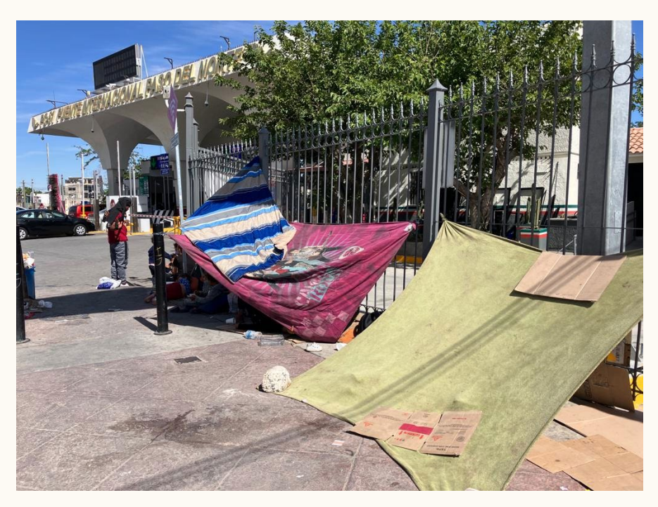
Families wait to seek asylum on cardboard under improvised shelter outside the Juarez Paso del Norte Port of Entry, June 2023.

A Venezuelan woman was unaware of asylum ban as she and her family tried for months to get CBP One appointment, but in fear that her daughters would be kidnapped, trafficked, or raped, attempted to approach port of entry even after being apprised of ban's penalties to protect her daughters but was turned away by CBP and Mexican immigration officers. The woman, her young daughters and her adult sister have been trying for two and three months, respectively, to obtain a CBP One appointment and have been living on the street in Matamoros without money for shelter or food. They told of how someone had photographed them while walking on the street and a black truck followed them late at night. They reported that a friend of theirs had been raped in her tent. They feared for their and their daughters' safety, afraid of being kidnapped, trafficked, raped. They were unaware of the asylum ban and its likely bar on asylum and the risk of deportation to Mexico. When confronted with a decision over the short-term immediate need for safety versus waiting for long-term interests, the women shared: