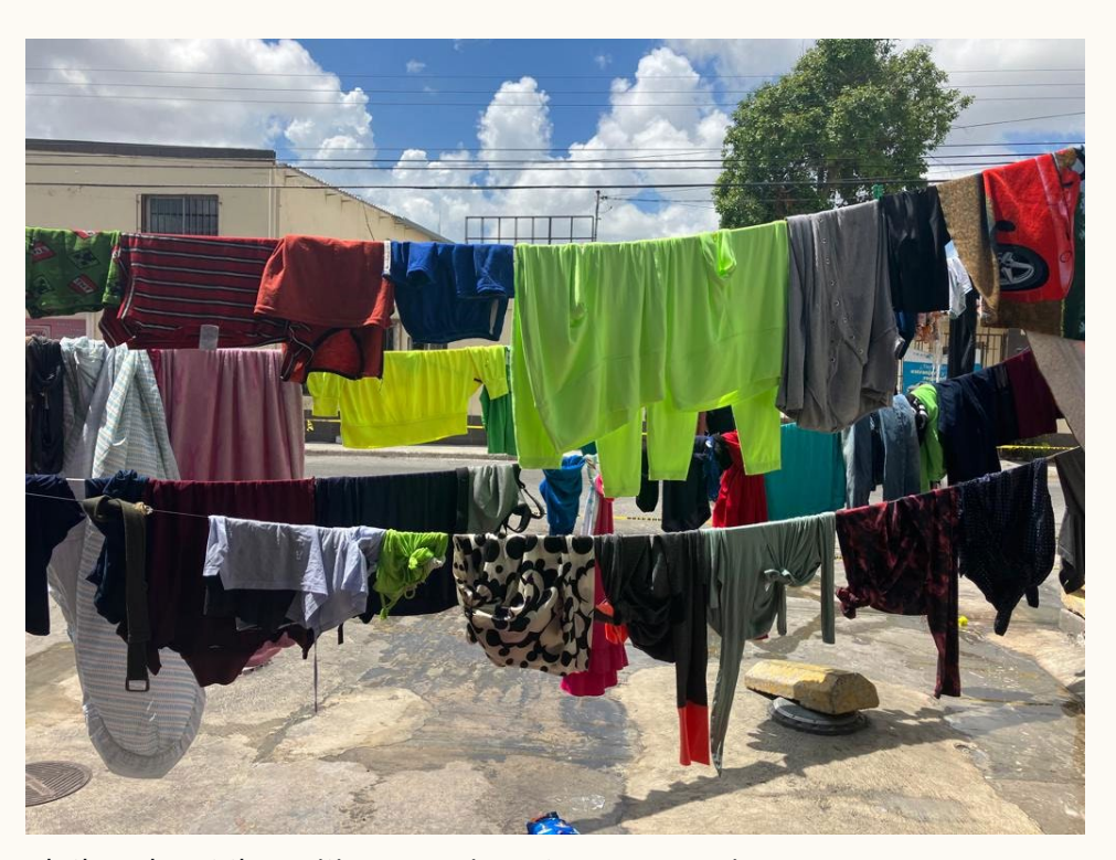
Clothes dry at the Haitian camp in Matamoros, Mexico.

and described how they have to come up with money to buy internet data and has had to beg for money to pay for internet data.