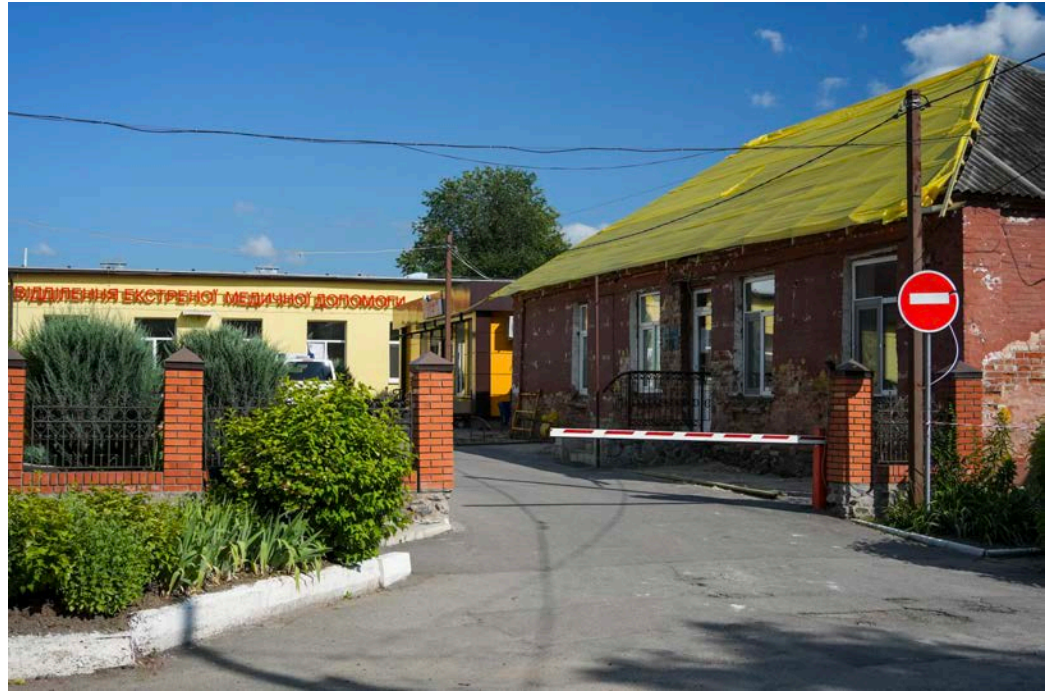
A medical clinic in Dergachy under construction after damage from Russian forces.

In the Kharkiv Oblast, there are also reports of irregularities in the repairs to healthcare buildings. According to publicly available documents, agreements worth 5.29 million hryvnias (USD $143,000) were struck in June 2023 to repair medical and sports and health facilities damaged in the Russian invasion of Dergachy, a community about eight miles northwest of the center of the city of Kharkiv.