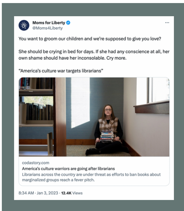
A tweet by Moms for Liberty depicting a librarian and advocate against book bans as a "groomer."

Local: At the local level, the anti-trans campaign—and broader campaign against inclusion—focuses on school boards and classrooms, and leverages claims of "parental rights." For instance, California Assembly Bill 1314 , Gender Identity Parental Notification would allow parents to sue schools if they fail to disclose that a student identifies as trans. This practice, called ' forced-outing ' can harm the child's safety and increase suicide.