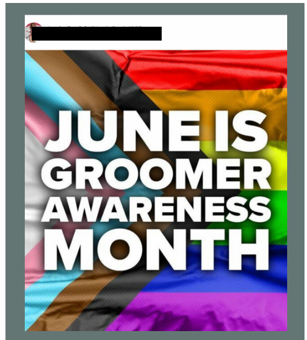
A social media post sharing a pride flag that conflates LGBTQ+ with "groomers."