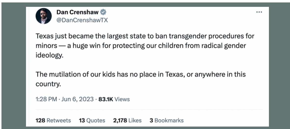
A tweet by Representative Dan Crenshaw that showcases an example of anti-trans legislation being proposed by members of Congress.

Narrative 4: Gender Affirming Care and Education Harms Children: These narratives claim gender-affirming care is exploitative and dangerous, and LGBTQ+ support in school indoctrinates and sexualizes children. For example, Florida Governor Ron DeSantis ginned up support for a law banning gender-affirming care for minors by referring to it as child “mutilation.”