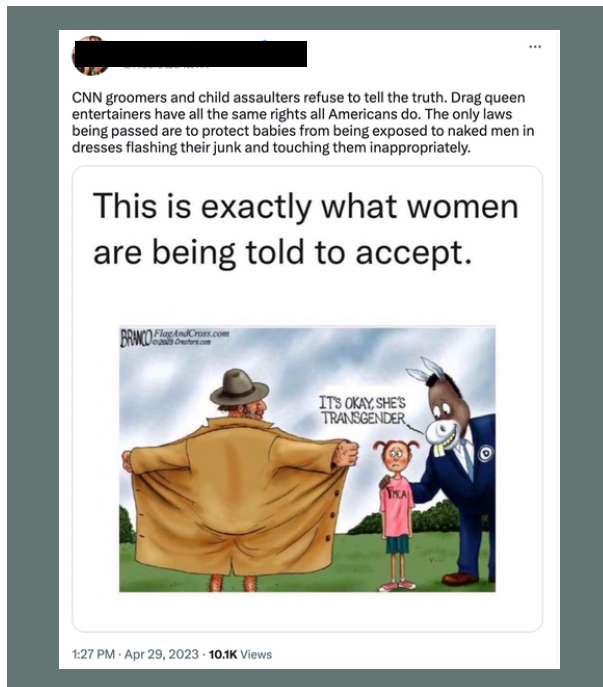
A social media post sharing a cartoon depicting Democrats and trans people as "groomers" and sexual predators.

Far-right mainstream leaders are spearheading this campaign, including politicians like Governor Ron DeSantis , Senators Marco Rubio and Ted Cruz ; media pundits like Matt Walsh and Ben Shapiro ; and organizations like Moms for Liberty and the Family Research Council .